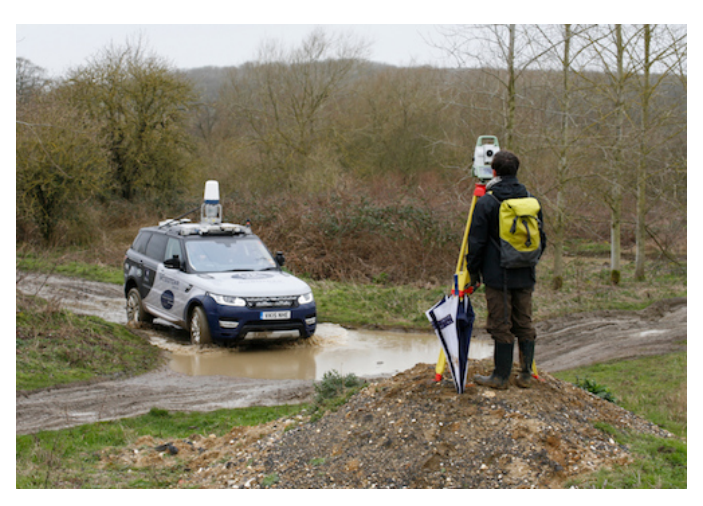
Figure 4: The Leica laser tracker used for ground-truth recording during one of the off-road trials.

However, many urban datasets have been released in recent years [40]–[42]. For this reason, we are in the process of collecting a new dataset with the intention of encouraging research into introspection and explainbility of Autonomous Driving (AD) systems in totally under-investigated driving scenarios. To this end, our focus for data capture revolves around unusual sensing modalities , mixed driving surfaces , and adverse weather conditions .