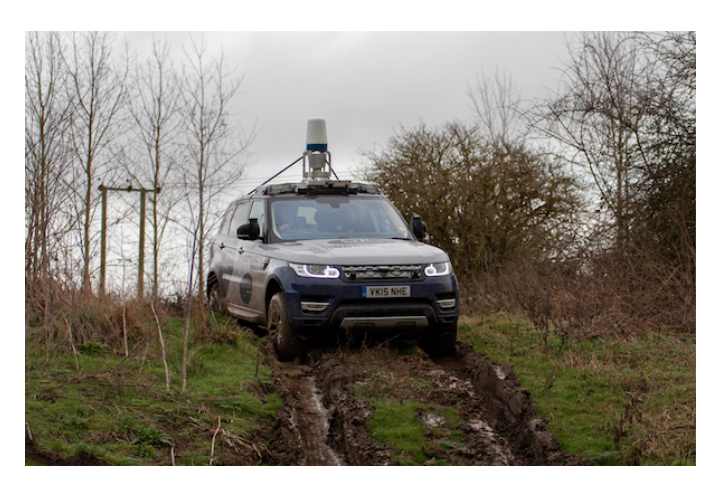
Figure 2: Our primary vehicle, a Jaguar Land Rover, while traversing an off-road scenario during one of the data-collection trials.